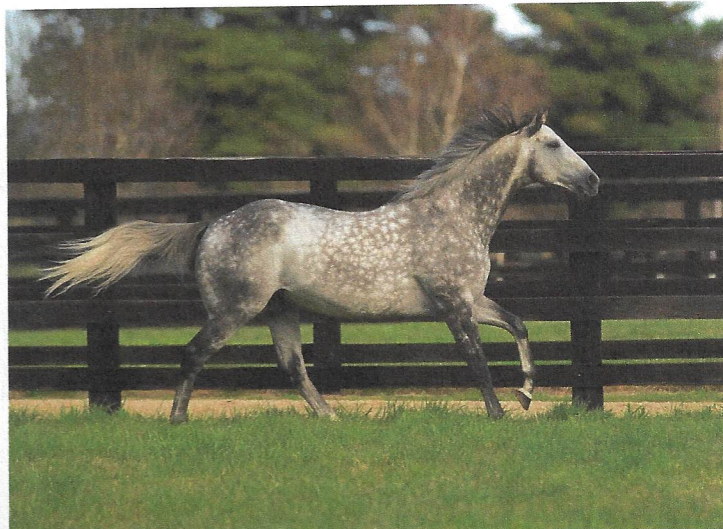
Frosted